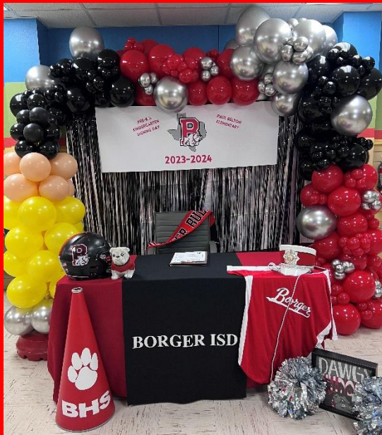
Signing Day at Belton