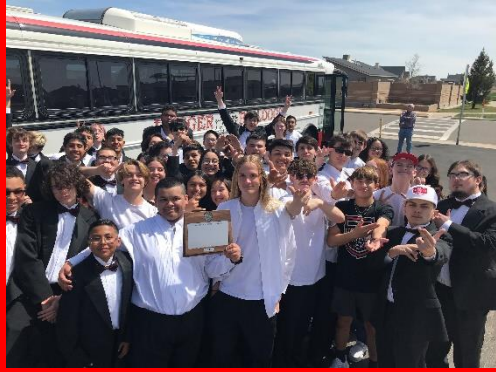
BHS Band UIL Region 1 Concert and Sight-reading Contest