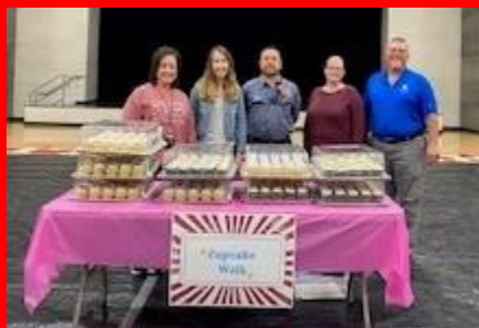
Phillips 66 donated cupcakes to the 5 th -grade Science Carnival