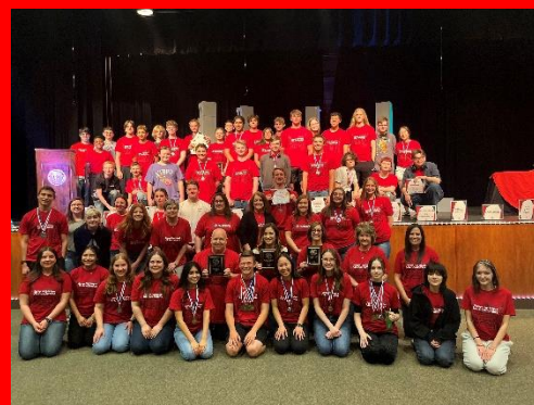
UIL Academic Teams and Coaches