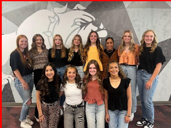
BHS Cheer Team 2023-24