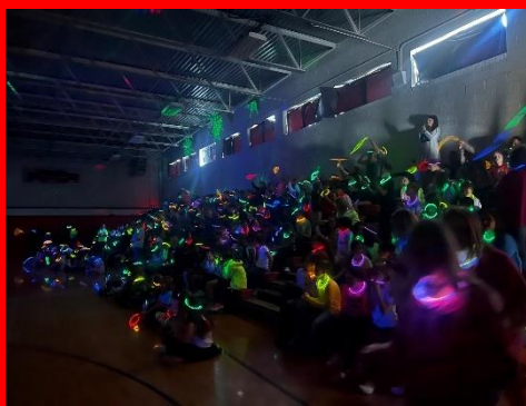
BIS Pep Rally