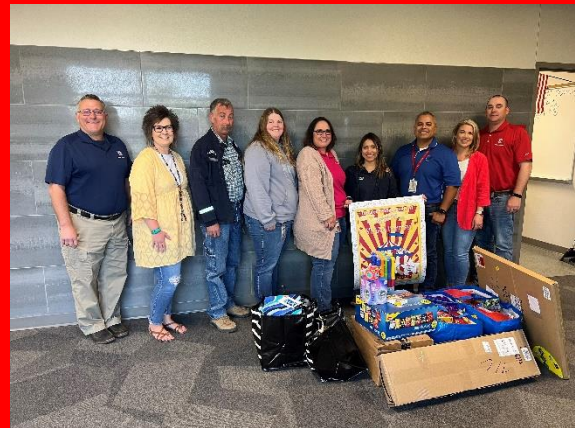
Phillips 66 recently donated supplies and prizes for the 8 th -grade Science STAAR carnival at Borger Middle School!! Several networks through Phillips 66 pitched in, including the Veteran's Network, the Women's Network, and the New Hire Network.