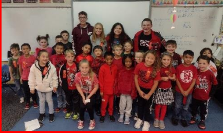
BHS students visited the other campuses for Red Ribbon Week