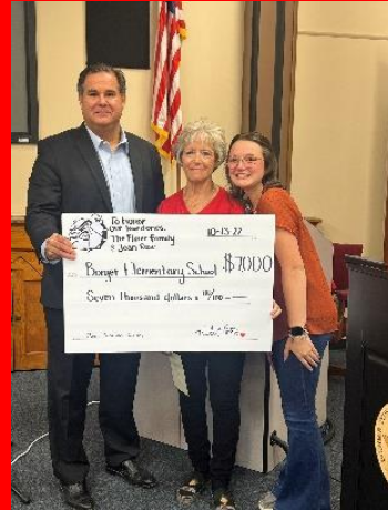
Florer Family Donation