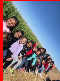
2 nd -grade Pumpkin Patch