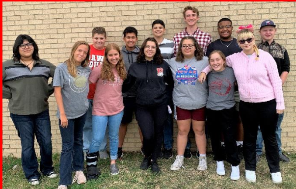
BHS All-Region Choir