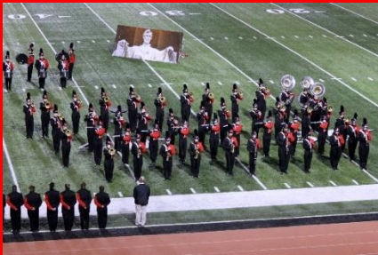
Mighty Bulldog Band at the UIL Region 1 Marching Band Contest