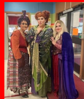
Borger ISD Campuses had special visitors on Halloween!