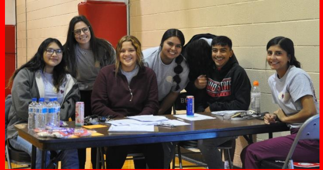
Health Science Practicum hosted a blood drive in conjunction with Coffee Memorial Blood Center as part of their community service project.