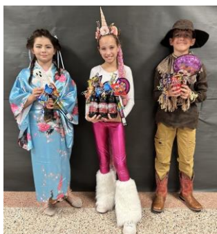
Borger Intermediate Costume Contest Winners