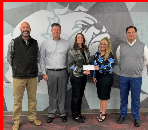
CP Chem Donation