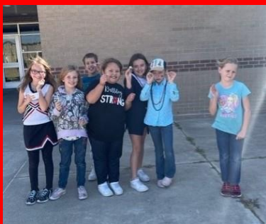
Crockett student leaders picking up trash