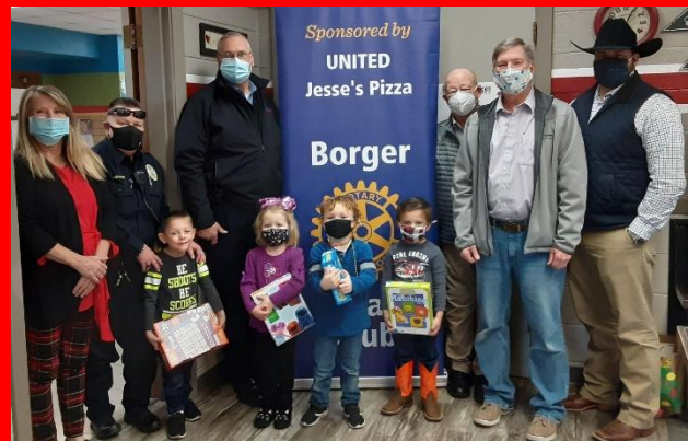
Kindergarten and Pre-K Perfect Attendance Winners