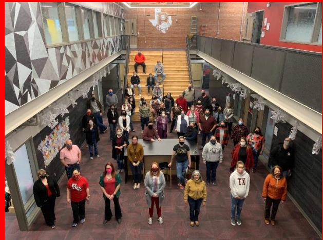
BHS Staff 2020-2021