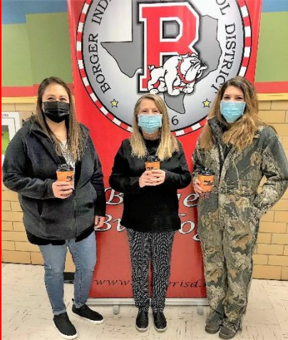
Paul Belton Elementary staff were happy to receive hot cocoa from a parent during morning drop off!