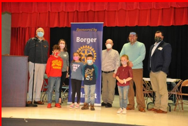
Gateway and Crockett Perfect Attendance