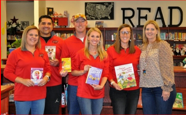
Borger Youth Sports Initiative donation