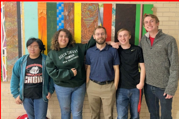
BHS All Region Choir members