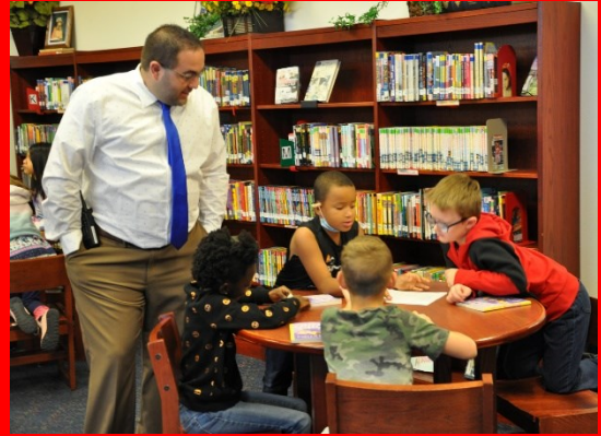
Battle of the Books!