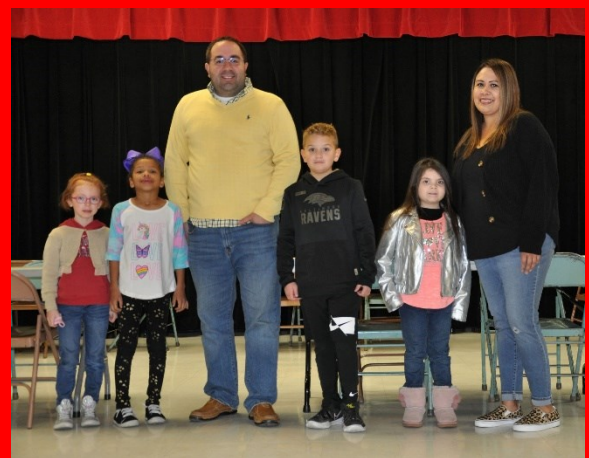
Gateway & Crockett Bike Assembly