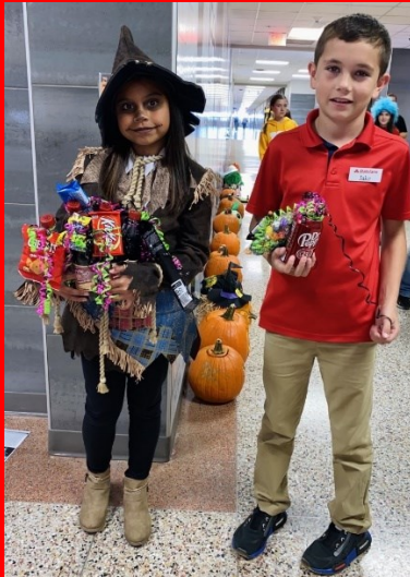
BIS Halloween Awards