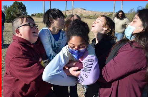
BMS C.O.P.E. Course