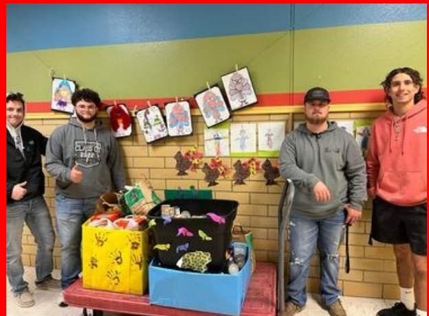
STUCO Canned Food Drive