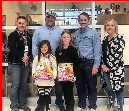
Solvay birdhouse donation