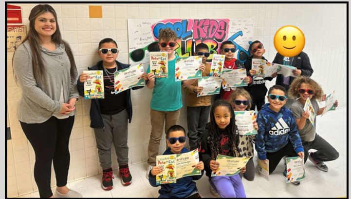
3rd Six-weeks Gateway Kool Kids