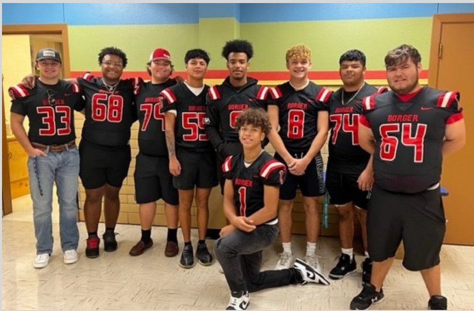
Bulldogs at Paul Belton Elementary on Game Day!