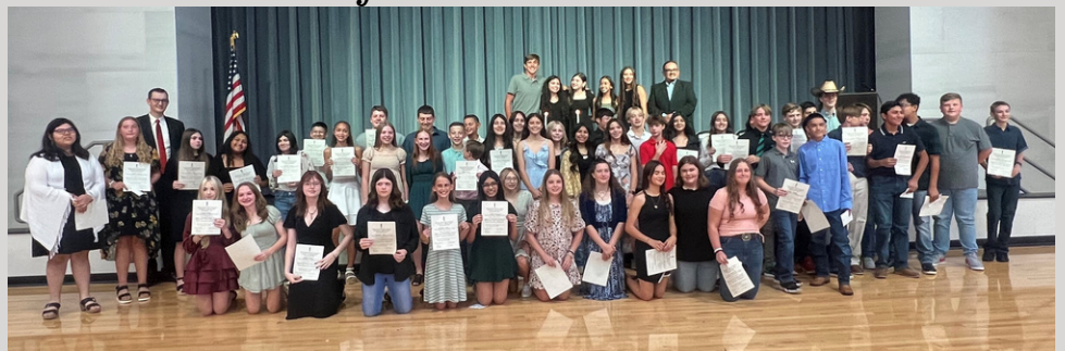
On September 28, 2023, the Borger Middle School National Junior Honor Society inducted 56 new students into the organization.