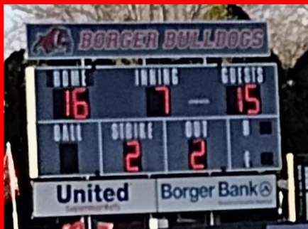
After being down 0 to 11, the Lady Bulldog Softball Team fought back for a 16 to 15 victory over Canyon West Plains!