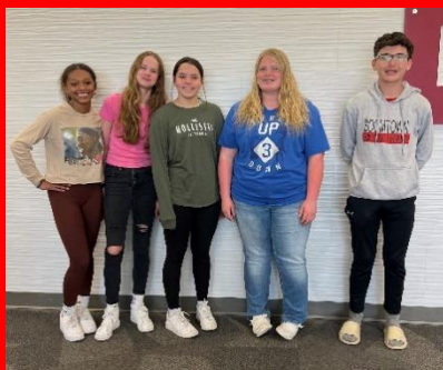
BMS Track Team who made the Prelims