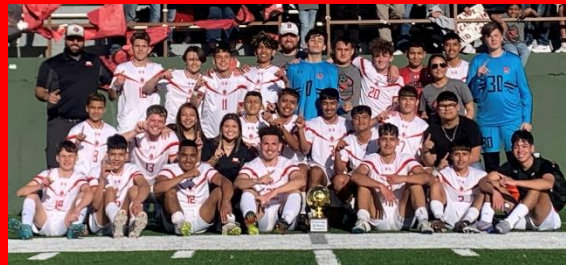
Bulldog Soccer with their Bi-District Trophy