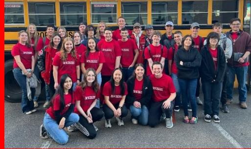
BHS UIL Academic Team