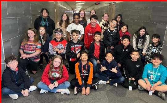
BIS Top Dawgs