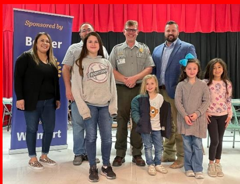
Gateway/Crockett Elementary Perfect Attendance Assembly