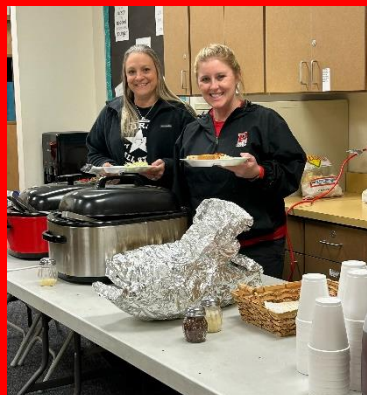
Grace Church provided lunch for Crockett Elementary.