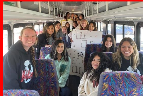
The Lady Bulldog Soccer travelled to Andrews to support the boys team!