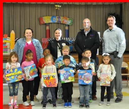
Belton Attendance Winners