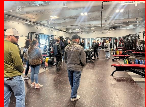
Leadership Borger Tour at Bulldog Stadium