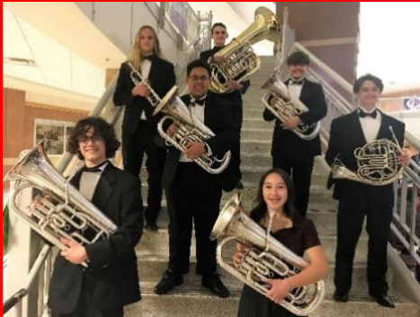
BHS All-Region Band