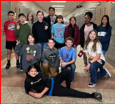
BIS Top Dawgs for the 6 weeks