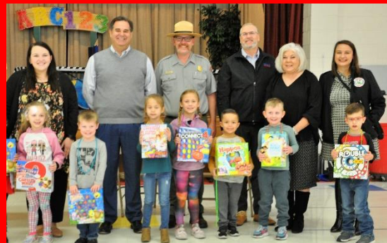
Gateway, Crockett, and Belton Perfect Attendance Winners