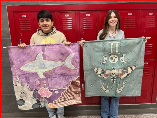
Mrs. Renick's student's Batik pieces in Art 3 and 4