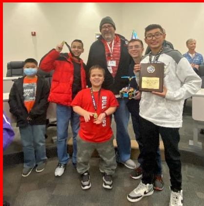
Bullbots with their 1 st place plaque