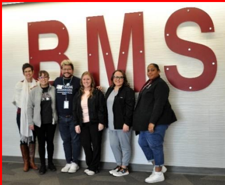
UT SPAN Health Team visit.