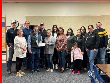
Solvay Citizen's Day Donation