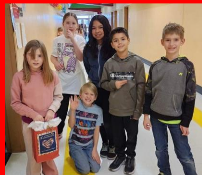
Mrs. Oeile's PEAK class presents a new student with a gift bag with information about Crockett Elementary!