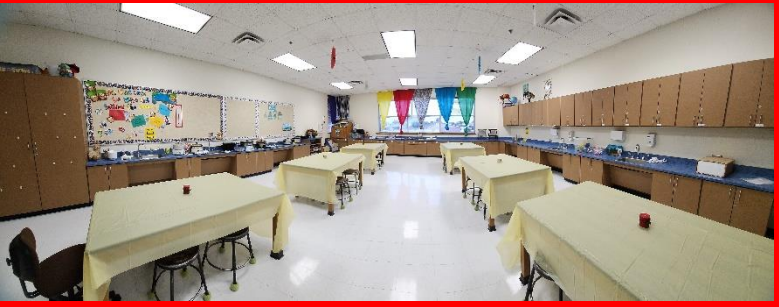
Gateway Elementary had an Instructional Assistant Appreciation Luncheon!