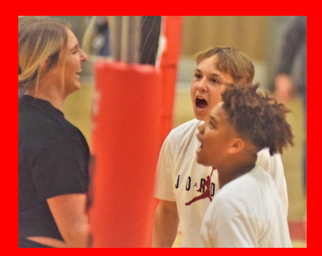
BMS Student vs Staff Volleyball games