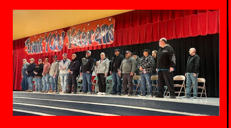
Crockett Veteran's Day