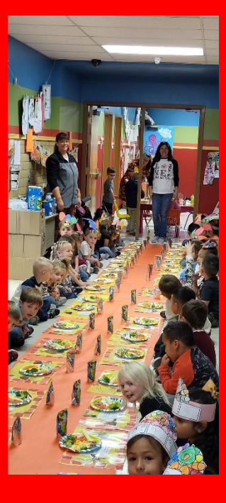
Annual Thanksgiving Feast at Paul Belton Elementary