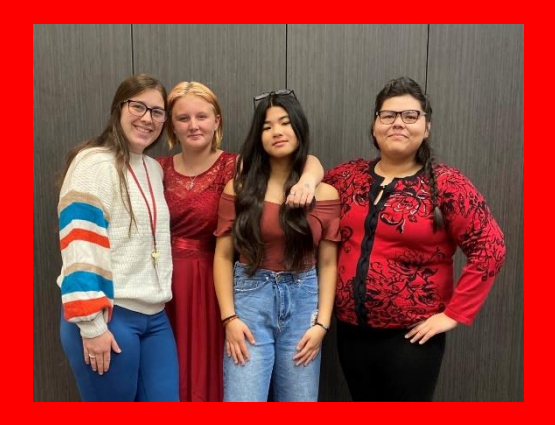
BMS All-Region Choir