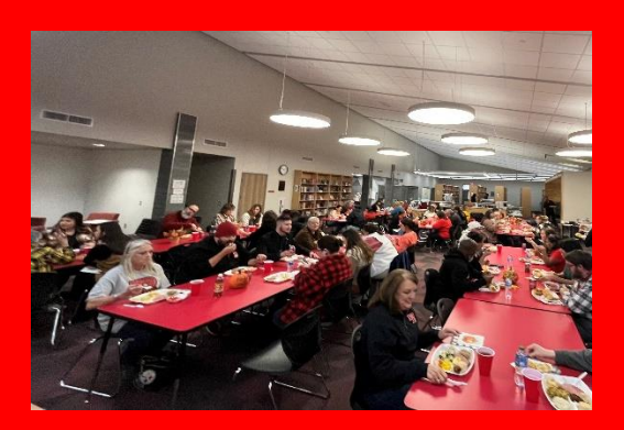
BHS Thanksgiving Celebration