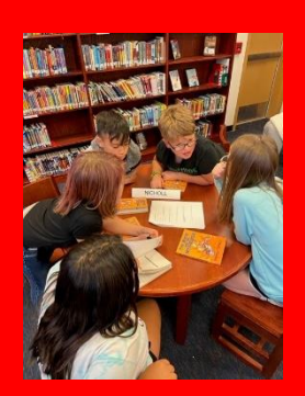
Battle of the Books