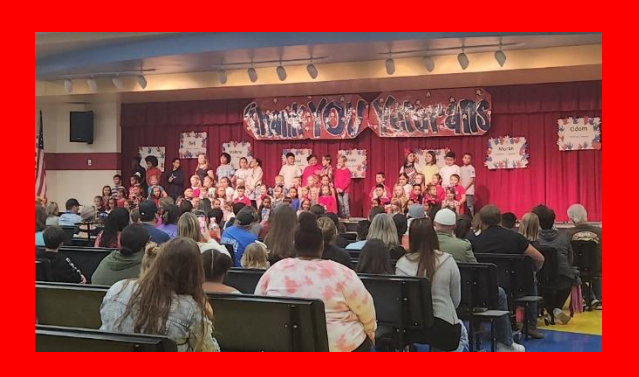
Gateway 2<sup>nd</sup>-grade Veteran's Day Program