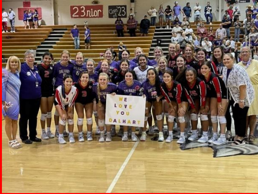
Lady Bulldog Volleyball with the Dalhart Lady Wolves