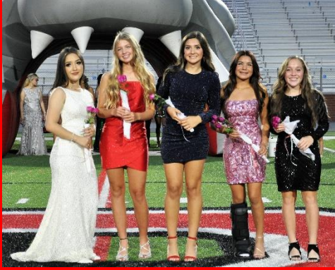
← Freshman Princesses