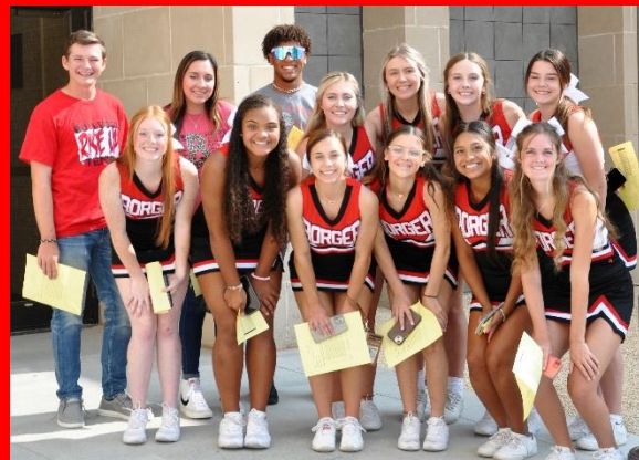
Helping at Pup Camp!