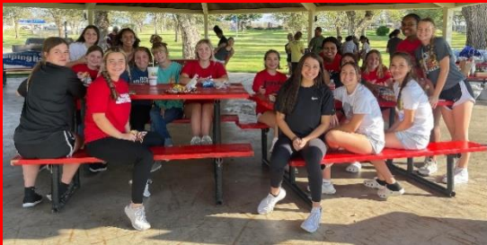
Lady Bulldogs at the Helping Hand Event