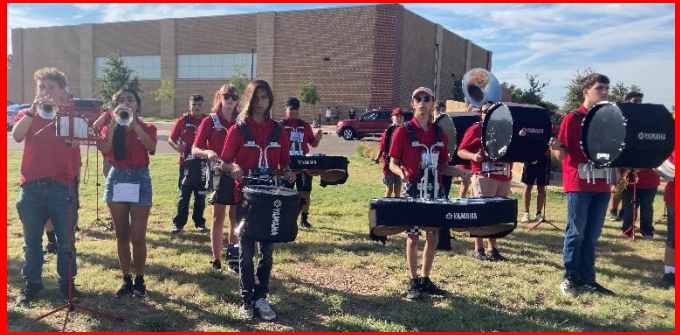
BHS Band Marchathon