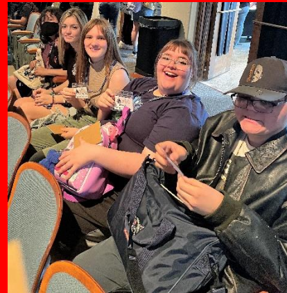
BHS Students at Texas Panhandle Art Education Association High School Art Conference!