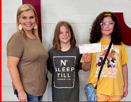
BIS Penny War Donation