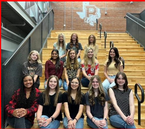
Borger High School 2022-2023 Cheerleading Squad