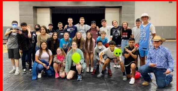
NJHS at the BIS Science Fair