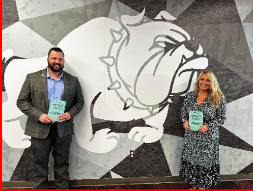
Anxiety Workbook Donations