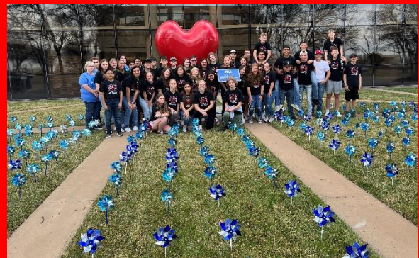
NJHS Child Abuse Awareness Month