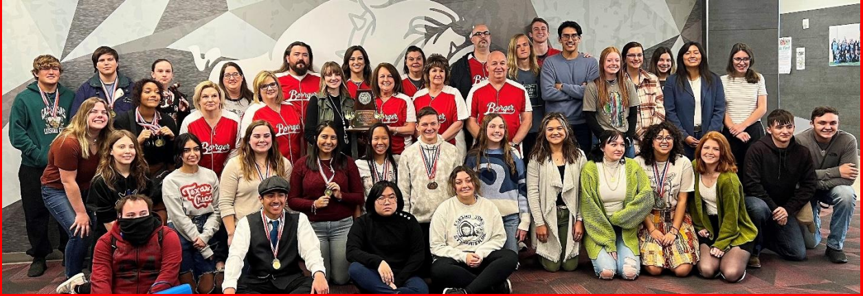
BHS UIL Teams and Coaches