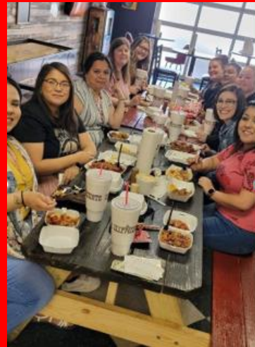
BMS Instructional Assistants on IA Day