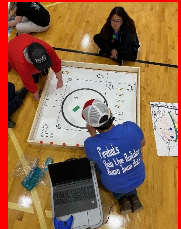
The BMS Robotics Team at the TCEA Robotics Competition