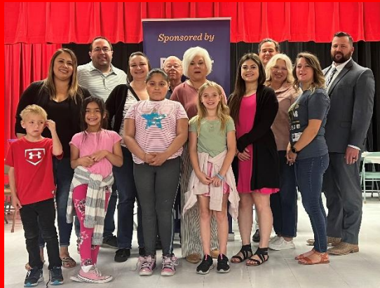
Gateway/Crockett Perfect Attendance Assembly