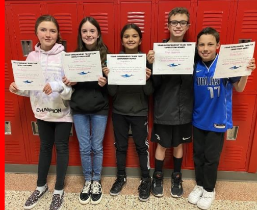
5 th -grade Shark Tank Winners