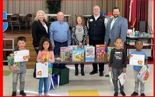
Belton Perfect Attendance Assembly