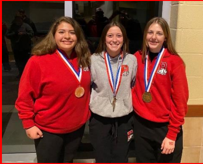
Lady Bulldog Wrestlers at State