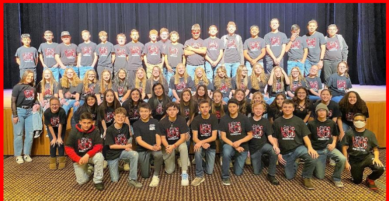
Borger Middle School National Junior Honor Society