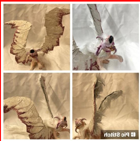
Shelby Redd, "Royal Flush"