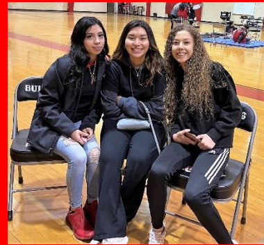
BHS Blood Drive