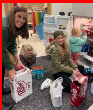
Gateway and Crockett PTO "Filled the Fridge" in February.