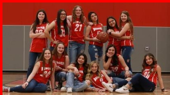
8 th -grade Ladies Basketball White team went undefeated this year!