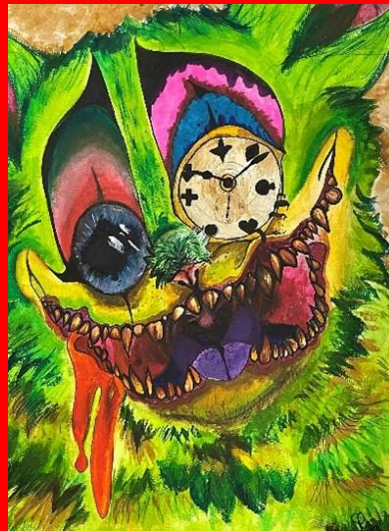
Shelby Redd, "Clockwork Chaos"