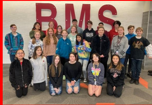
BMS Choir Solo and Ensemble