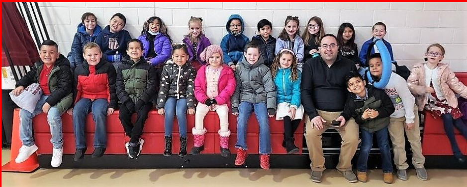
2 nd -graders attending the Amarillo Symphony