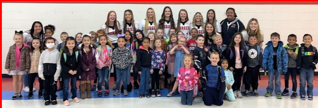
Lady Bulldog Varsity Softball players visited Paul Belton Elementary Little Bulldogs