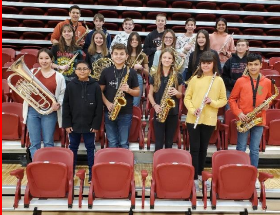
BMS Band Solo & Ensemble