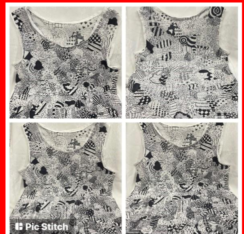
Liberty Keeney, "Wearable Wonder"