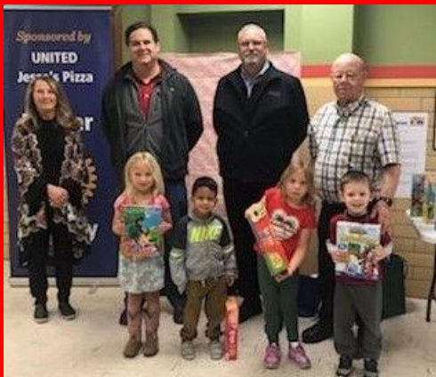
Belton Perfect Attendance Winners