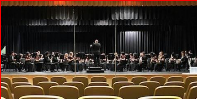
Band at UIL Region