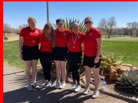
Lady Bulldog Golf at District