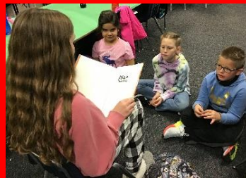
BMS students Reading to Gateway scholars