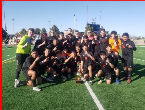
Boys Soccer Win Bi-District