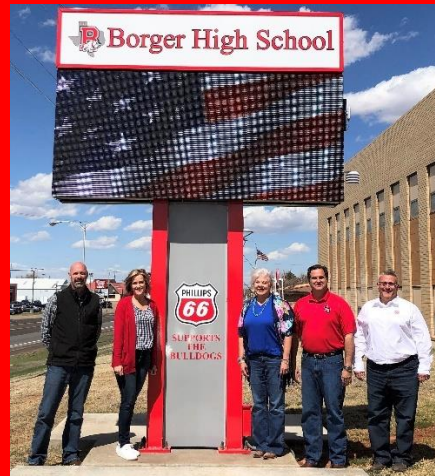
New digital sign at BHS on Cedar