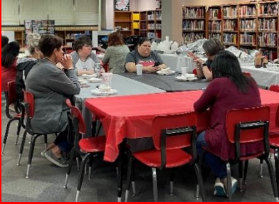
BMS Staff Enjoying Hipshots!