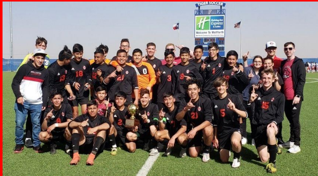
Bulldog Soccer after the Area Play-off Game