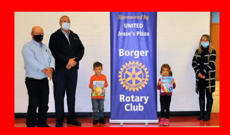
Belton Perfect Attendance Winners