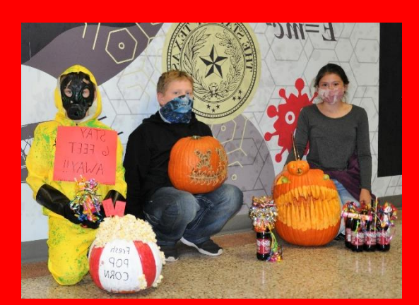
5<sup>th</sup>- grade Pumpkin Winners