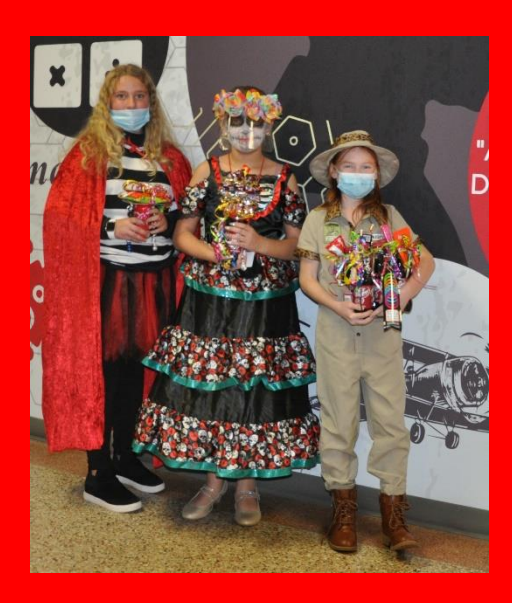
5<sup>th</sup>-grade Costume Winners