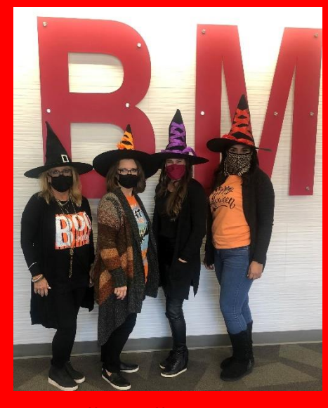
The BMS Office Staff joined in on the Red Ribbon/Halloween Fun on dress-up Day.