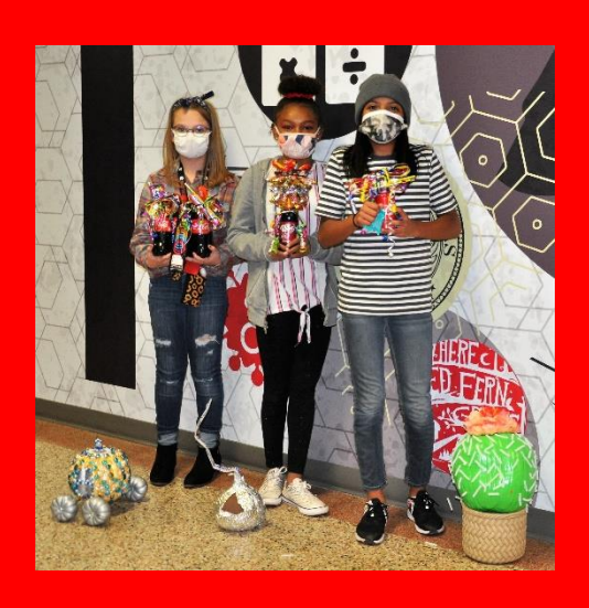
6<sup>th</sup>-grade Pumpkin Winners