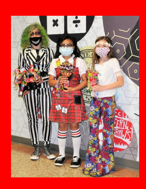
6<sup>th</sup>-grade Costume Winners